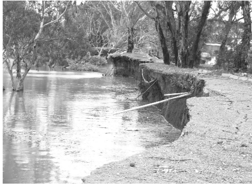
Slumping at Long Island Marina