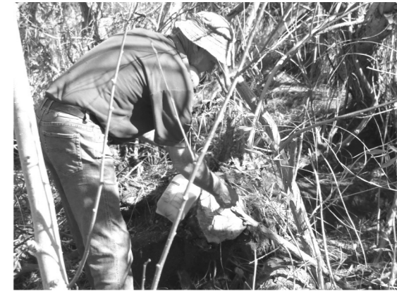
Willow control works